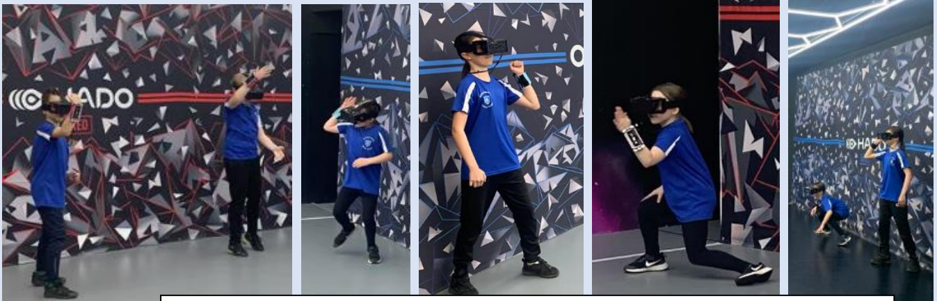
Team 'Hado' had a great time trying out Virtual Reality sport! See more details

As you know, we have discontinued use of Class Dojo this half term as detailed in the letter I sent before half term. Do please speak with your child's class teacher at the end of the school day on the gate if you need a quick chat or call the school office if you have an urgent matter.